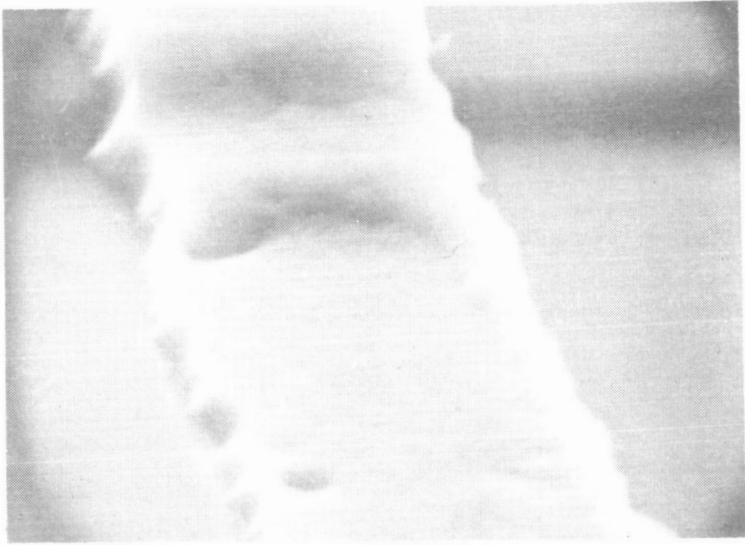
Figure 3—SEM picture of good metallization. Aluminum at oxide step is smooth and continuous. Magnification is 5500X.