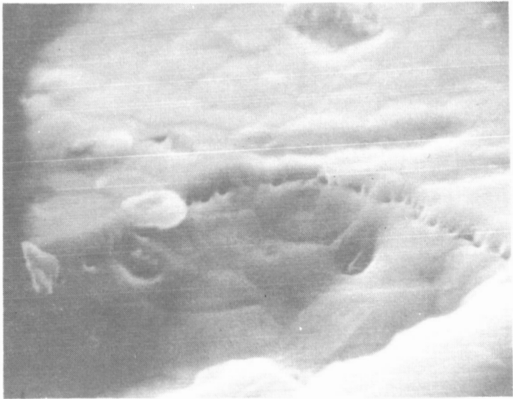
Figure 4—SEM picture of marginal metallization. A borderline case because of the number of discontinuities in aluminum at oxide step. Magnification is 5500X.