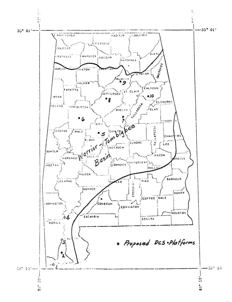
Figure 3. Location of test area (the entire State of Alabama).