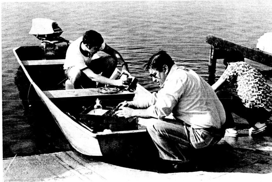
Figure 2. Former data gathering procedure (manual method).