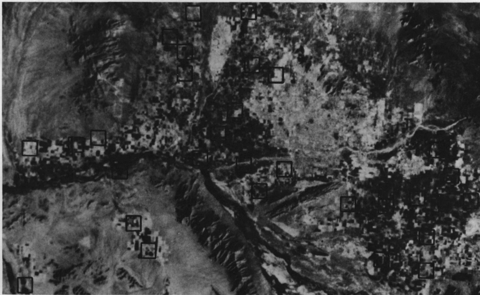
Figure 2: This black-and-white enlargement of an Apollo 9 space photo shows the portion of Maricopa County containing agricultural lands, and for which the semi-operational survey was performed. The location of each of the 32 4-square-mile plots selected for ground survey at the time of each NASA overflight is as indicated.