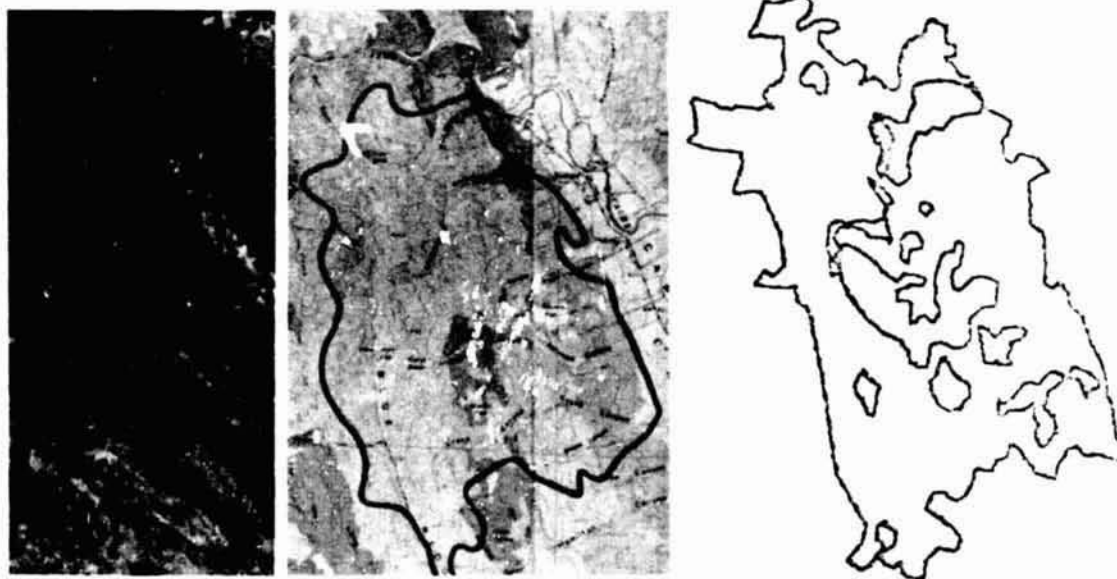
Figure 6. A portion of an ERTS-1 MSS band 7 image showing the Pocket Gulch burn is on the left. The California Division of Forestry map of the burn is in the middle (estimated acreage = 10,340). A map derived from the ERTS-1 image is on the right (estimated acreage = 13,340).