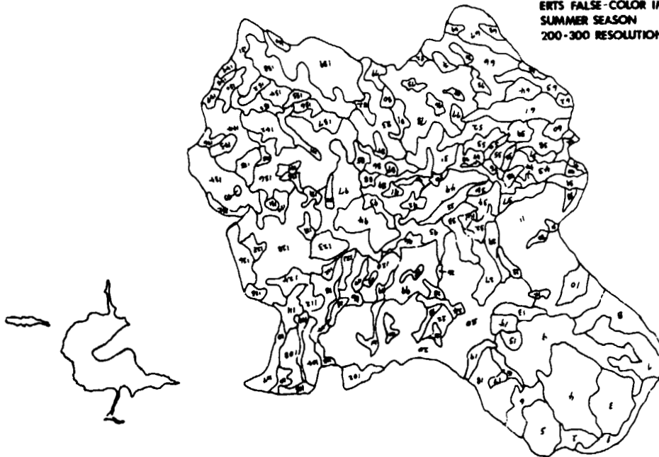
Figure 4. Forestland stratification boundaries made from 78 conventional black-and-white photographs, original scale 1:15,840, at the top and a small portion of an ERTS-1 image, original scale 1:1,000,000 at the bottom.

ERTS FALSE-COLOR IMAGE SUMMER SEASON 200-300 RESOLUTION