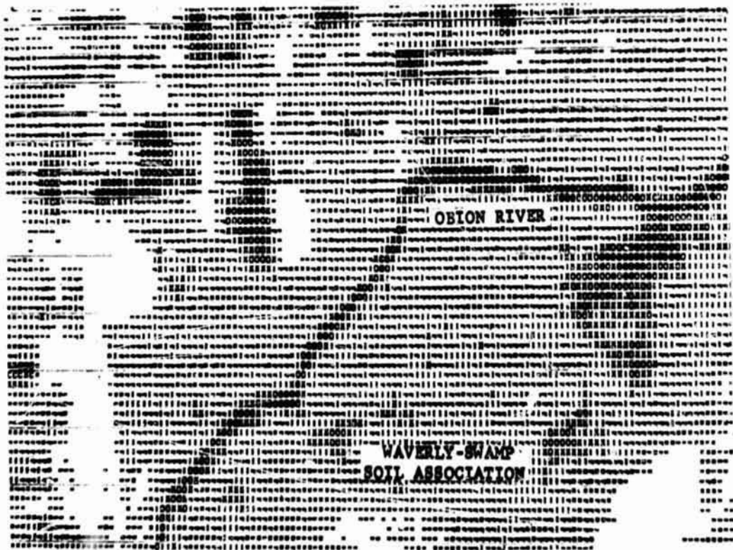
Figure 3. Computer printout from ERTS-1 imagery evaluation showing the Obion River and the adjacent Waverly-Swamp area.