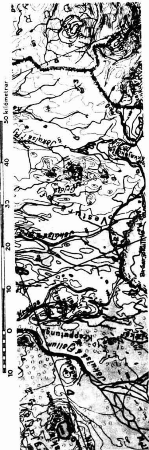
Figure 2. - Comparison of ERTS-1, MSS image (14 Oct. 1972, E-1083-12021-5) of a part of northwest Iceland with a 1:500,000 scale map (Geodaetisk Institut, Copenhagen, 1945) of the identical area. Of particular interest are the geologic and hydrologic changes evident and mappable from the ERTS-1 image: (1) Vikrahraun lava flows (1.61) 6km northwest of Öskjuvatn, (2) new position of the snouts of Brúarjökull and the surging glacier, Eyjabakkajökull, and (3) appearance, disappearance, and changes of lakes.