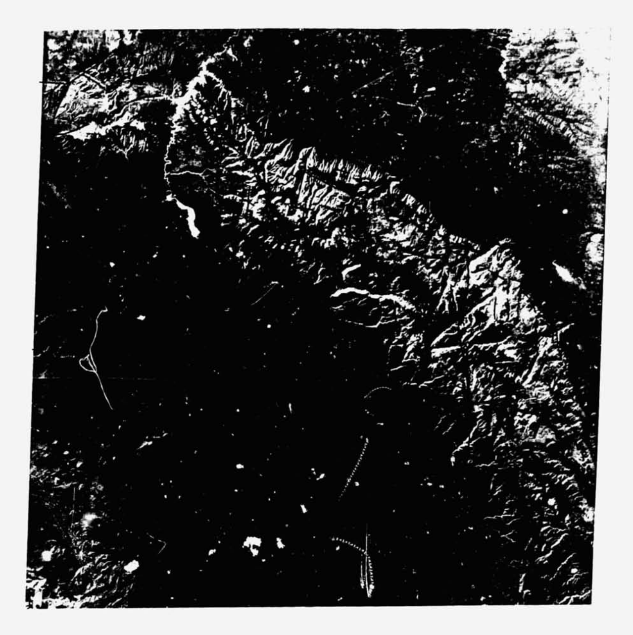
Fig. 2 - Negative print, MSS-7 with overlay. See text for annotation.