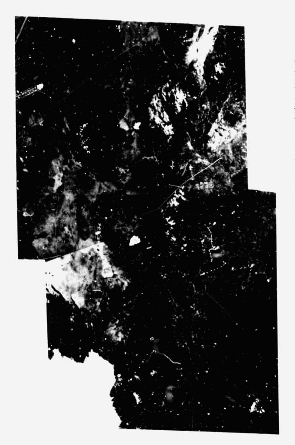
Fig. 1. A mosaic of ERTS images of 25 November (RH) and 26 November (LH) showing the Lus Angeles Basin, Transverse Ranges, and Mojave Desert. The zone of tectonic lineations with the 73° azimuth is located in the accompanying map.