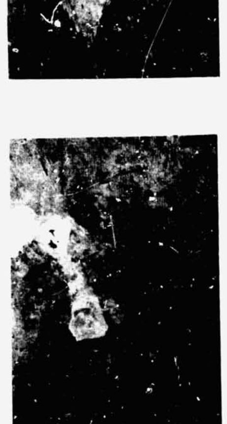
Fig. 3. Rosamond Dry Lake and Lineament. Band 5. November 26, 1972