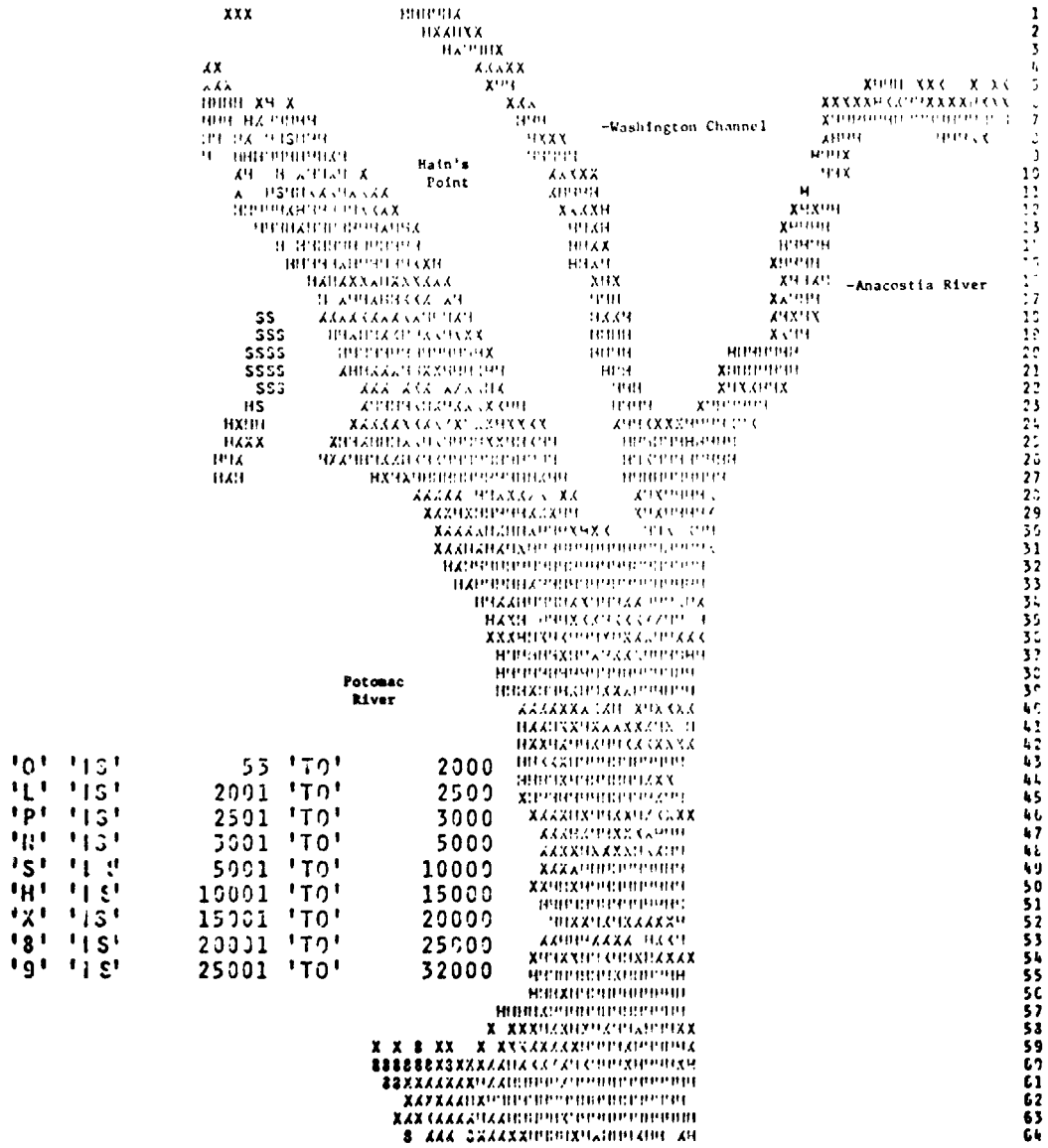
Figure 2 Digital Display of Sedimentation 10 Oct 72

'1030-1519201' '110 T72' ' SUN EL35 A2140 ' 30 'DEG' 53 'MIN IS IN RO.' 11/0 70 'DEG' 58 'MIN IS IN COLUMN NUMBER' 435 'MGS RWD FOR DATA IS' 4 X 5 X 0