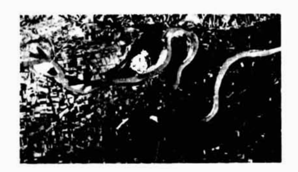
a) In 1946