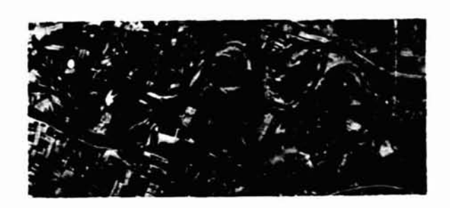
a) Aerial photograph