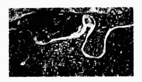
b) In 1956