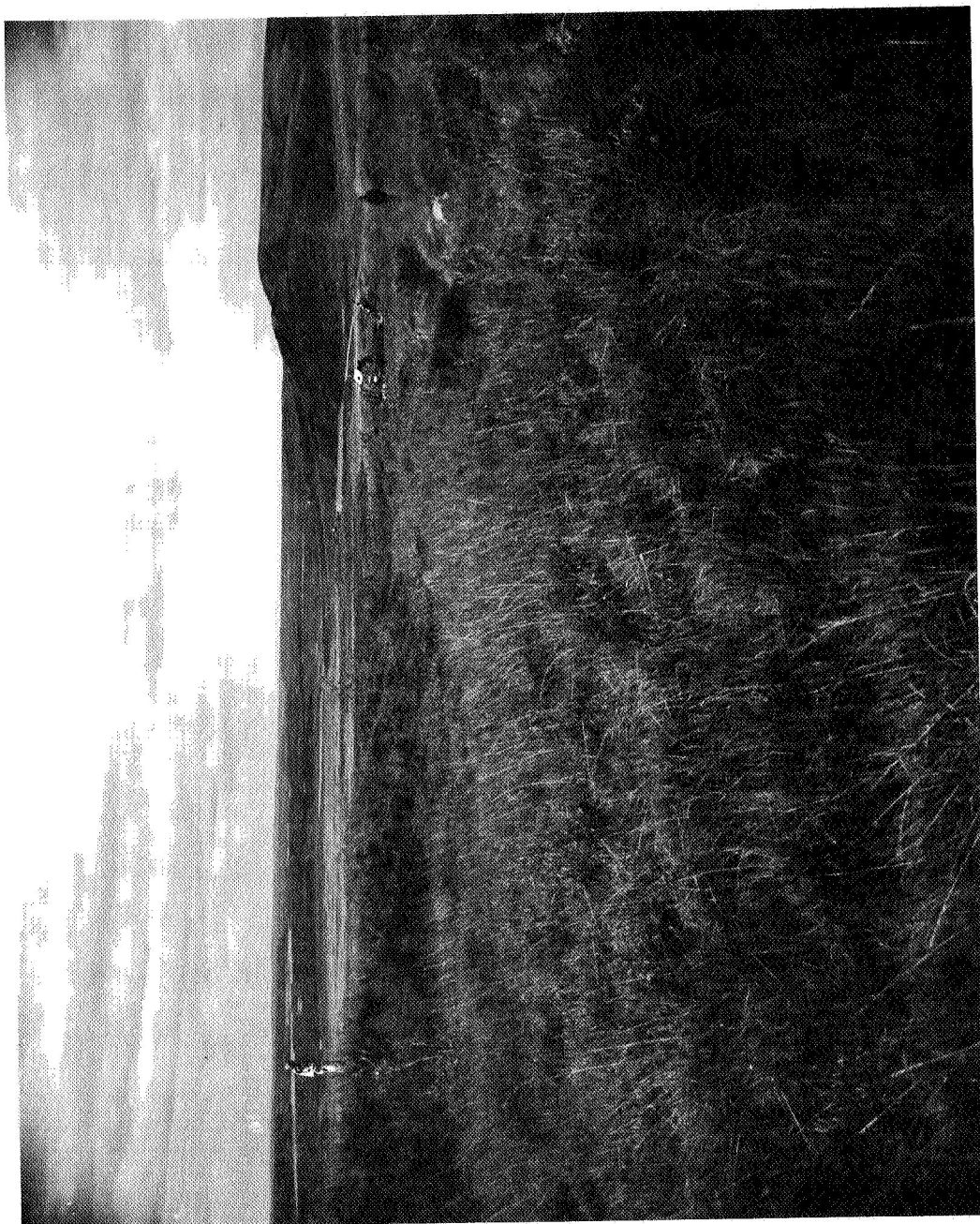
Figure 6. Severe scar on ridge north of Umiat.