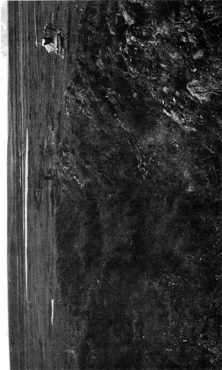
Figure 5. Scar formed by more recent activity than 1952