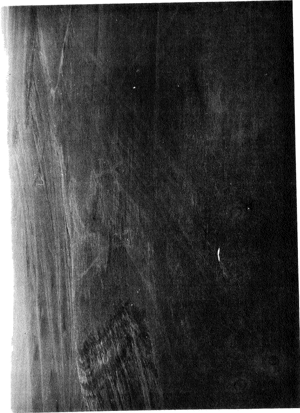
Figure 2. Old trails on hills near Umiat.