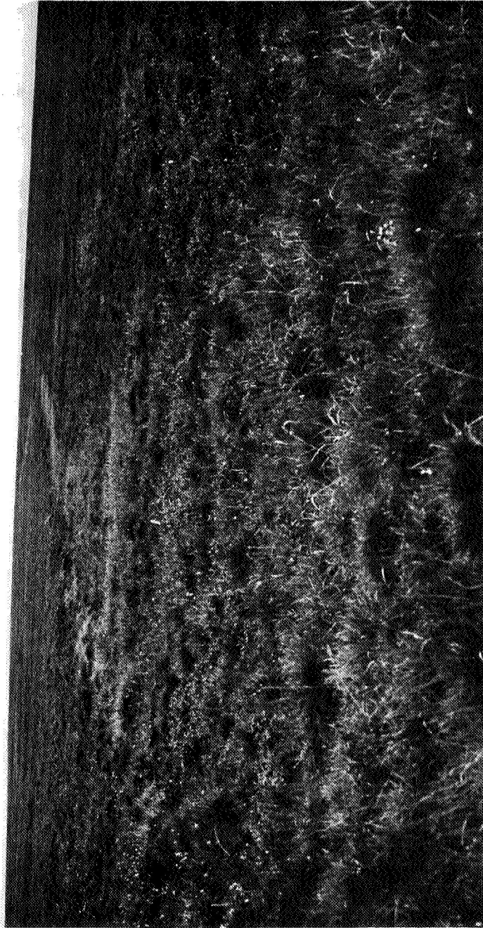
Figure 3. Old trail in ice-poor soil near Umiat seen from ground.