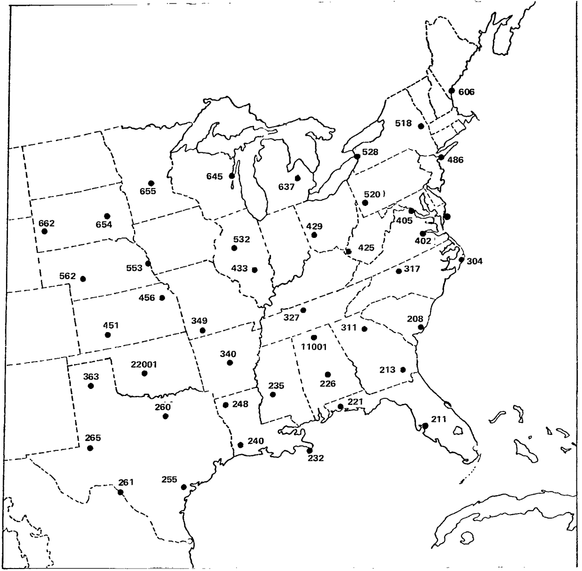
Figure 1. Rawinsonde stations participating in the AVE III project.