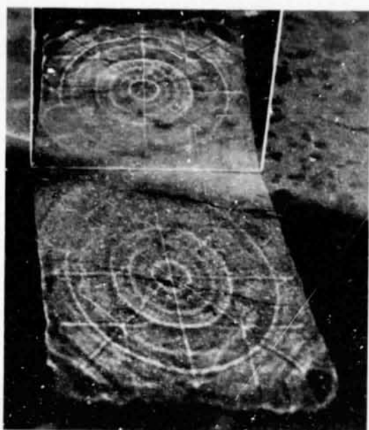
a. Rib Print-Through Circular Tool Pattern