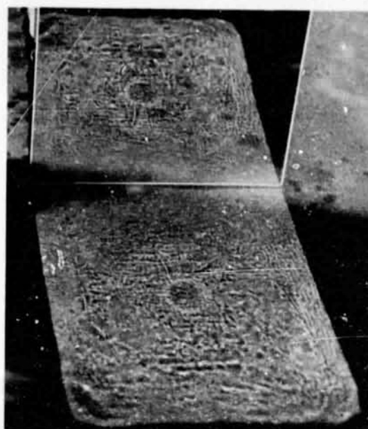
b. No Rib Print-Through Subtle Circular Pattern 0.95 mrad Slope Error