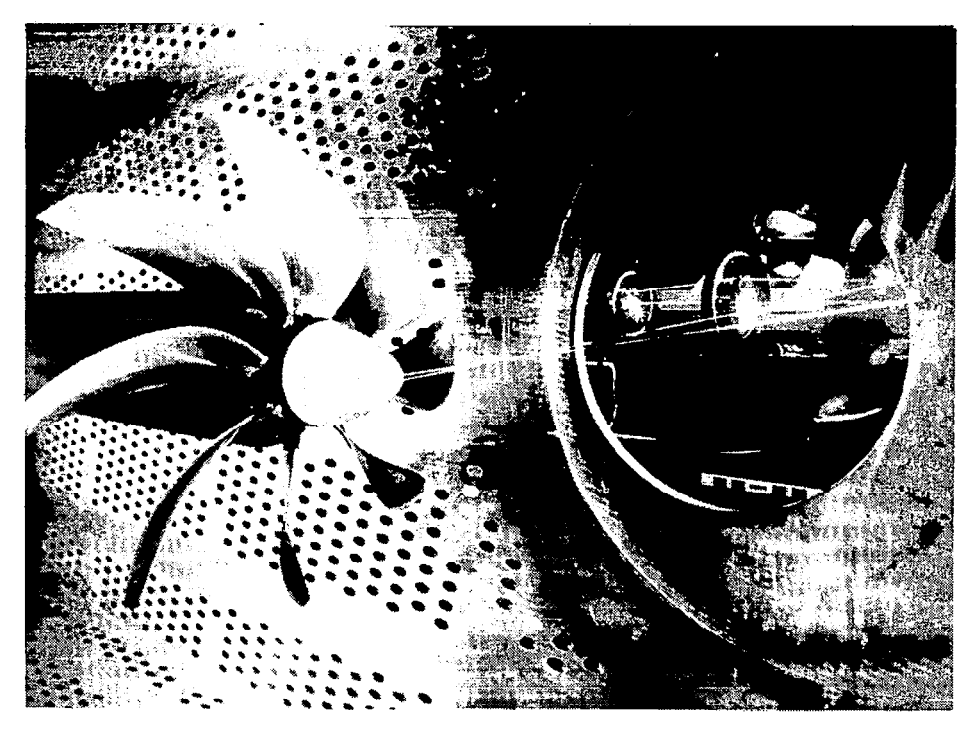
Figure 1.- SR-3 propeller installed in NASA Lewis 8 \times 6 Foot Supersonic Wind Tunnel.