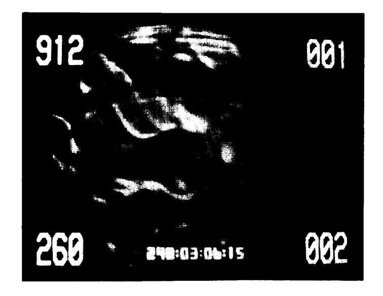
Figure 2. Schlieren map of a turbulent "solar-model" case with rapid rotation and spherically symmetric heating. The equator is at the top of the picture and the pole is at the bottom. The features propagate prograde at the bottom and top of the frame, while moving retrograde at mid-latitude.