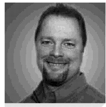
ABOUT THE AUTHOR

When I walked into the building, I saw tears in people's eyes and many on the team seemed lost. Our NASA Headquarters teammates did an outstanding job