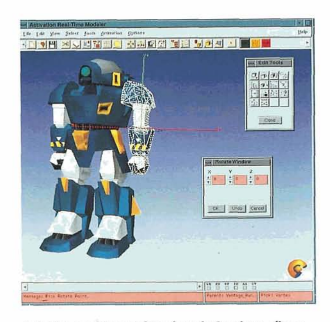
Activation, a real-time graphics software by Coryphaeus, allows a user to incorporate models, animation sequences, and character animation into a game being prototyped.

Software tools developed by Coryphaeus yield real-time 3D visual simulations ideal for plotting the twists and turns of a highway for planning purposes.