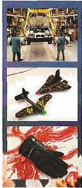
NASA-sponsored work on gloves that can keep an astronaut's hands from freezing while working in space has been applied to ski gear.