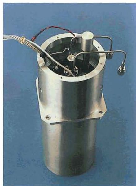
J-T cryostats produce cryorefrigeration by expanding a gas from high pressure through a nozzle.