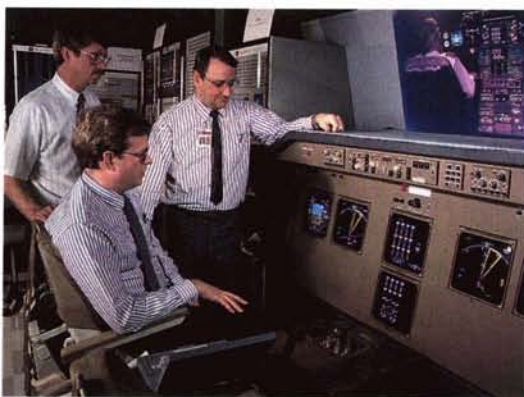
Engineers of Collins Commercial Avionics work on windshear displays in the company's laboratory mock cockpit facility. The product, Collins' WXR-700WR predictive windshear system, is shown at right; at bottom is the avionics box that houses the computer and above it is the radar disc, which is mounted on a movable arm in the nose of the airplane.