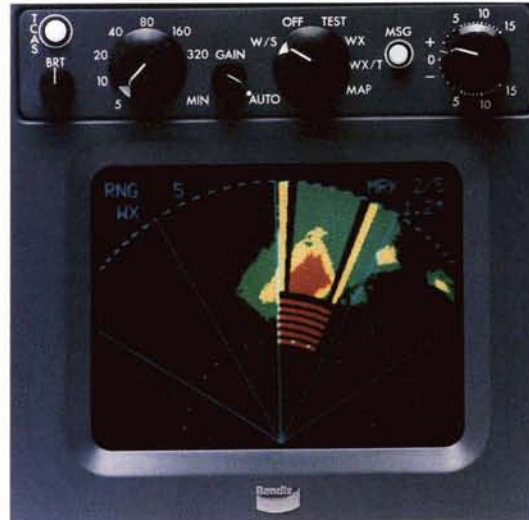
AlliedSignal's Bendix RDR-4B system includes the antenna (background), a receiver/transmitter (center) and a Planned Position Indicator (PPI). Shown in closeup above, the PPI displays the direction and distance of a windshear microburst in addition to the normal en route weather display.

Meanwhile, NASA was trying to effect the broadest possible transfer to industry of the safety-enhancing predictive windshear technology. In addition to the usual practice of disseminating technical papers, NASA and FAA jointly sponsored well-attended windshear conferences and invited potential manufacturers to track the development of windshear detectors. Three major avionics manufacturers — AlliedSignal; Westinghouse Electronic Systems Group, Baltimore, Maryland; and Rockwell Collins Commercial Avionics, Cedar Rapids,