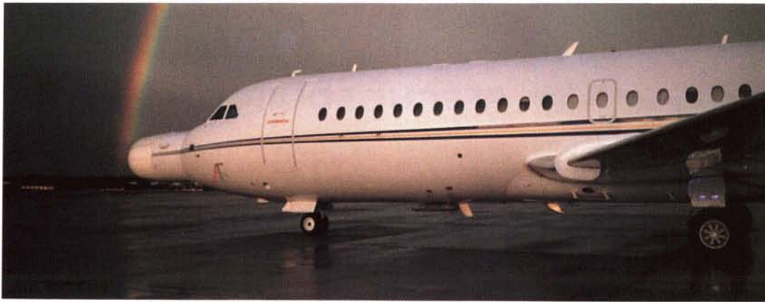
Westinghouse Electronic Systems flew this BAC 1-11 transport through more than 200 windshear encounters to test the MODAR MR-3000 and MR-4000 predictive weather radars. The "black box" — the radar equipment (left) — is housed in the aircraft's bulbous nose.

to general weather information and windshear prediction, the MR-4000 offers advanced mapping and navigational capabilities. The windshear detection elements of both the MR-3000 and the MR-4000 were derived from NASA technology.