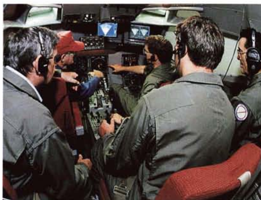
In the 737's windowless research cockpit, aft of the regular flight deck, researchers study the special informational displays generated by ground and airborne windshear detectors.

Langley selected two atmospherically-different field sites for the joint NASA/FAA flight test program: one at Orlando, Florida, the other at Denver, Colorado; both areas were noted for frequent microbursts in summertime. The flight test plan was simple: when ground radars