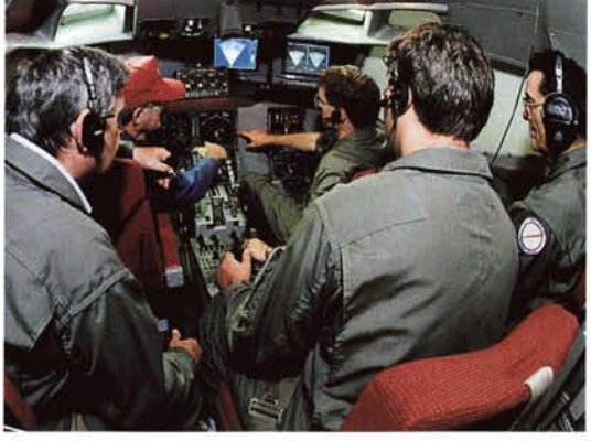
In the 737's windowless research cockpit, aft of the regular flight deck, researchers study the special informational displays generated by ground and airborne windshear detectors.

Doppler radar, the Doppler LIDAR and the infrared remote temperature sensor.