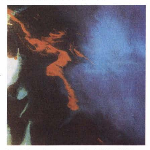
A Landsat image shows the spread of a Persian Gulf oil slick that occurred during the war-caused spill of February 1991. Research Planning, Inc. developed a remotely sensed information system for prioritizing protective measures during oil spills.

Traditional techniques for developing Environmental Sensitivity Index (ESI) maps for oil spill response are expensive, often inaccurate and unavailable in many parts of the world. The RPI/EOCAP project sought an advanced method of providing decision makers with timely, highly accurate, more readily updatable and more comprehensive ESI maps incorporating satellite remote sensing and GIS technologies.