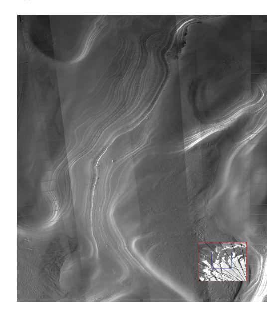
Figure 1: A fragment of THEMIS VIS mosaic of SPLD. The original image resolution is 36 m/pixel. Location of this fragment is shown in the lower right corner on top of the MOC image mosaic. Images were taken in early spring, while ground is still covered by CO_2 frost. Existence of frost on the ground is confirmed by the THEMIS IR data. Context image is shown in the lower-right corner (inside the blue box).

taken along the trough provide excellent high-resolution morphology.