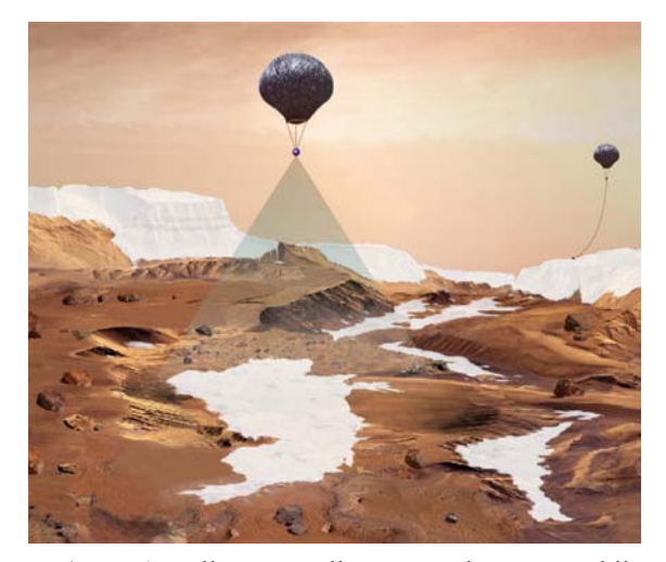
Figure 1 . Balloon sampling may enhance our ability to carry out exploration over rugged landscapes on Mars such as the polar caps and erg. Under development for solar driven Montgolfiere balloons is the ability to approach the surface for rapid acquisition with a "touch-and-go" sampler.

Unique Characteristics of a Balloon Platform: Key mission elements to complete the astrobiology