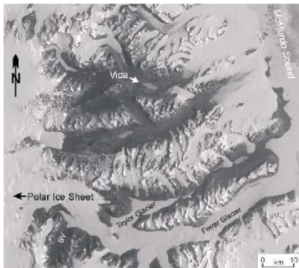
Figure 1: Landsat image of the dry valleys region showing location of Lake Vida. The image is centered at 77.5oS 162oE.

Introduction: Evidence for the presence of ice and fluids near the surface of Mars in both the distant and recent past is growing with each new mission to the Planet. One explanation for fluids forming spring-like features on Mars is the discharge of subsurface brines. Brines offer potential refugia for extant Martian life, and near surface ice could preserve a record of past life on the planet. Proven techniques to get underground to sample these environments, and get below the disruptive influence of the surface oxidant and radiation regime, will be critical for future astrobiology missions to Mars. Our Astrobiology for Science and Technology for Exploring Planets (ASTEP) project has the goal to develop and test a novel ultrasonic corer in a Mars analog environment, the McMurdo Dry valleys, Antarctica, and to detect and describe life in a previously unstudied extreme ecosystem; Lake Vida (Fig. 1), an ice-sealed lake.