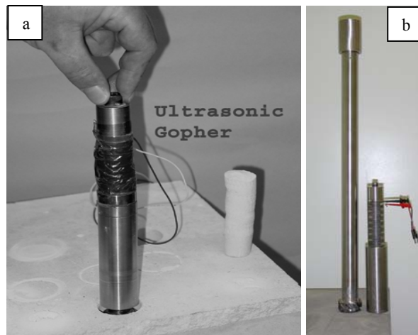
Figure 3: a) Ultrasonic-Gopher and extracted limestone core, b) Recent prototype of ice gopher. Ice chisel bit on the left and actuator on the right.

The USDC has been demonstrated to drill rocks that range in hardness from hard granite and basalt to soft sandstone and tuff. This novel drill is capable of high-speed drilling (2 to 20 mm/Watt·hr for a 2.85mm diameter bit) in basalt and Bishop Tuff using low axial preload (<10 N) and low average power (<5 W). The USDC mechanism has also demonstrated feasibility for deep drilling. The Ultrasonic-Gopher (Fig. 3a) can potentially be used to reach great depths and large diameters (3 and 4.5 cm have been demonstrated) using a low mass rover. Generally, the bit creates a borehole that is larger than the drill bit outer diameter and it also creates a core that is smaller in diameter than the inner diameter of the coring bit. This reduces the chances of bit jamming where hole integrity is maintained, and it eases in the extraction of the core from the bit. Current models suggest that the USDC performance does not change significantly with changes in ambient gravity.