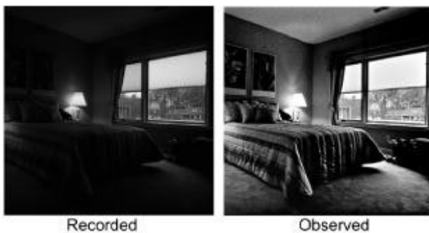
Figure 1. The discrepancy between recorded images and direct observation. Human vision strongly compresses visual information across wide-ranging illumination conditions within a scene.

A comparison of the recorded color image and the "view through the viewfinder" are strikingly different (Fig. 1) for most everyday scenes due to the presence of shadows. Color and detail in shadows are far more clear in the direct view than in recorded images. We have developed Land's concept of a center/surround retinex 1 to the level of single-scale retinex (SSR) design for which there is a trade-off between dynamic range compression and tonal rendition that is governed by the choice of the surround space constant. Comparison of processed images to direct scene viewing established that no value of an intermediate space constant could simultaneously provide sufficient dynamic range compression and good tonal rendition. The single-scale retinex provided a building block for the construction of a multi-scale retinex which does couple acceptable dynamic range compression with good tonal rendition. Color constancy is excellent for all forms of the retinex but color rendition was elusive as a result of the gray world assumption implicit to the retinex computation. A color restoration was developed and applied after the multiscale retinex in order to overcome this color loss but with a modest dilution in color constancy.