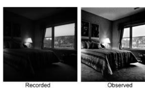
Figure 1. The discrepancy between recorded images and direct observation. Human vision strongly compresses visual information across wide-ranging illumination conditions within a scene.

A comparison of the recorded color image and the "view through the viewfinder" are strikingly different (Fig. 1) for most everyday scenes due to the presence of shadows. Color and detail in shadows are far more clear in the direct view than in recorded images. We have developed Land's concept of a center/surround retinex¹ to the level of single-scale retinex (SSR) design for which there is a trade-off between dynamic range compression and tonal rendition that is governed by the choice of the surround space constant. Comparison of processed images to direct scene viewing established that no value of an intermediate space constant could simultaneously provide sufficient dynamic range compression and good tonal rendition. The single-scale retinex provided a building block for the construction of a multi-scale retinex which does couple acceptable dynamic range compression with good tonal rendition. Color constancy is excellent for all forms of the retinex but color rendition was elusive as a result of the gray world assumption implicit to the retinex computation. A color restoration was developed and applied after the multiscale retinex in order to overcome this color loss but with a modest dilution in color constancy.