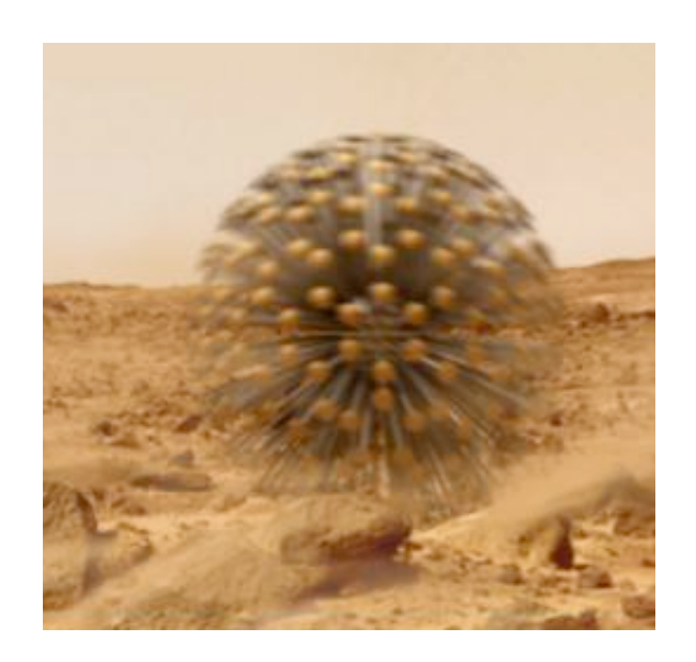
Figure 3. NASA Langley Research Center structured tumbleweed concept [2].