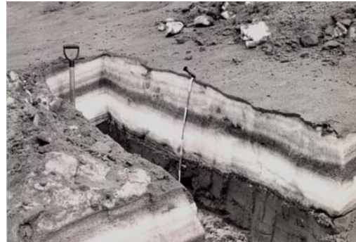
Figure 1. Niveo-aeolian deposits, Alaska.