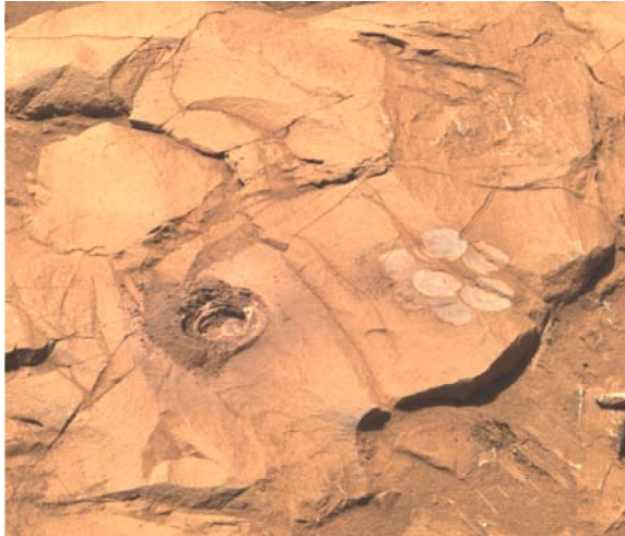
Figure 2. Pancam image (approx. true color) of a RAT hole and RAT "daisy wheel" brushing on the West Spur outcrop "Clovis."

and rocks on the West Spur. Goethite ( \alpha -FeOOH) was identified by MB in the outcrop "Clovis" (Fig. 2).