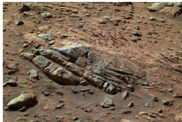
Figure 4. Pancam image (false color) of a layered outcrop "Uchben" near the summit of the West Spur.