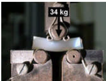
A cross-linked silica aerogel undergoing a three-point flexural bending test. The density of the monolith is \sim 0.55 \text{ g/cm}^3 . The density of the underlying silica is \sim 0.18 \text{ g/cm}^3 , and the

With this in mind, we were able to "glue" together the nanoparticle building blocks of a conventional silica aerogel, by templated, directed growth of the polymer on those particles. Thus, the resulting material is ~3 times more dense than the underlying silica aerogel framework but takes more than 300 times the force to break. The preceding photograph shows such a cross-linked silica aerogel monolith just before its break point.