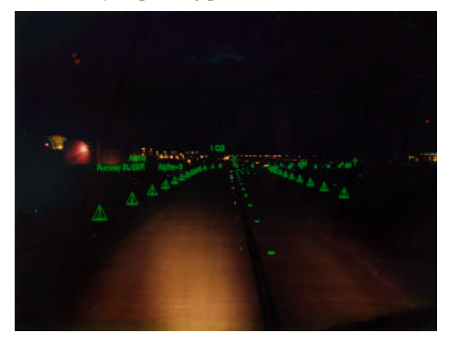
Figure 1. HUD Symbology During Taxi

guidance to a gate location (Figure 1). An additional capability during landing roll-out, was guidance to a hold-short point on the runway. All of the above were provided to enable all weather capability while reducing the likelihood of runway incursion by improving position awareness.