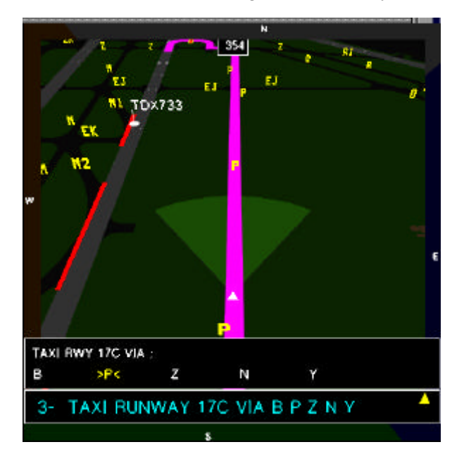
Figure 2. Electronic Moving Map