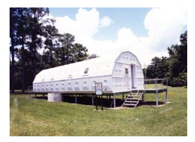
The BioHome at NASA's Stennis Space Center was 45 feet long, 16 feet wide, and used common indoor house plants as living air purifiers.

In 1973, NASA scientists identified 107 volatile organic compounds (VOCs) in the air inside the Skylab