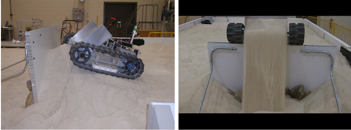
Figure 4 Ramp partially constructed (left) and complete (right).