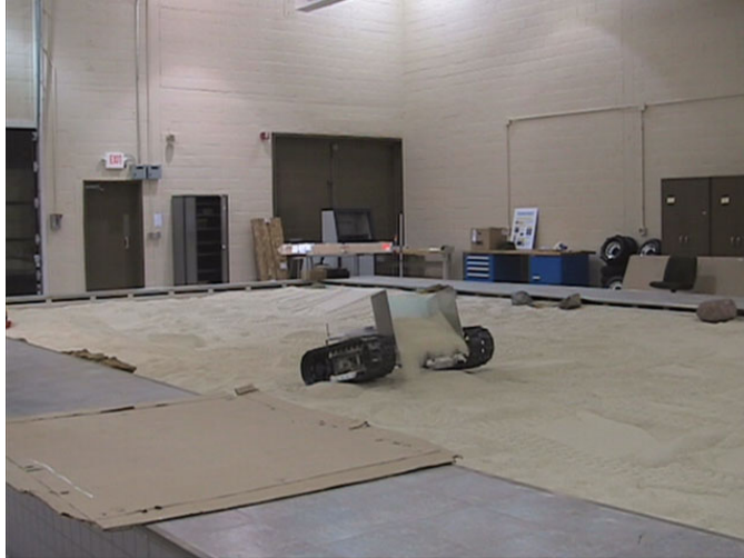
Figure 1. Cratos building a small ramp.

production and the particle size and properties were verified and acceptable for initial development testing. The loose sand (a low fidelity simulant) was a good starting point to verify a first generation small excavation system.