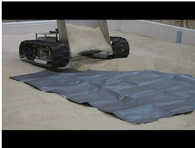
Figure 3 Cratos dumping a load of sand on a tarp.