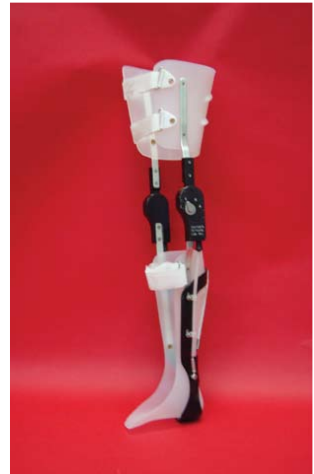
The brace may be used by a patient recovering from a knee injury when the knee cannot carry the full weight of the patient.

free motion or automatic stance control, for walking, and manual lock, for standing. The device locks the knee when the heel strikes the ground, but then releases when the heel lifts off the ground, which provides the user with a normal gait, while also providing stability while standing. The stance control feature can be triggered by weight bearing or joint motion, according to patient needs.