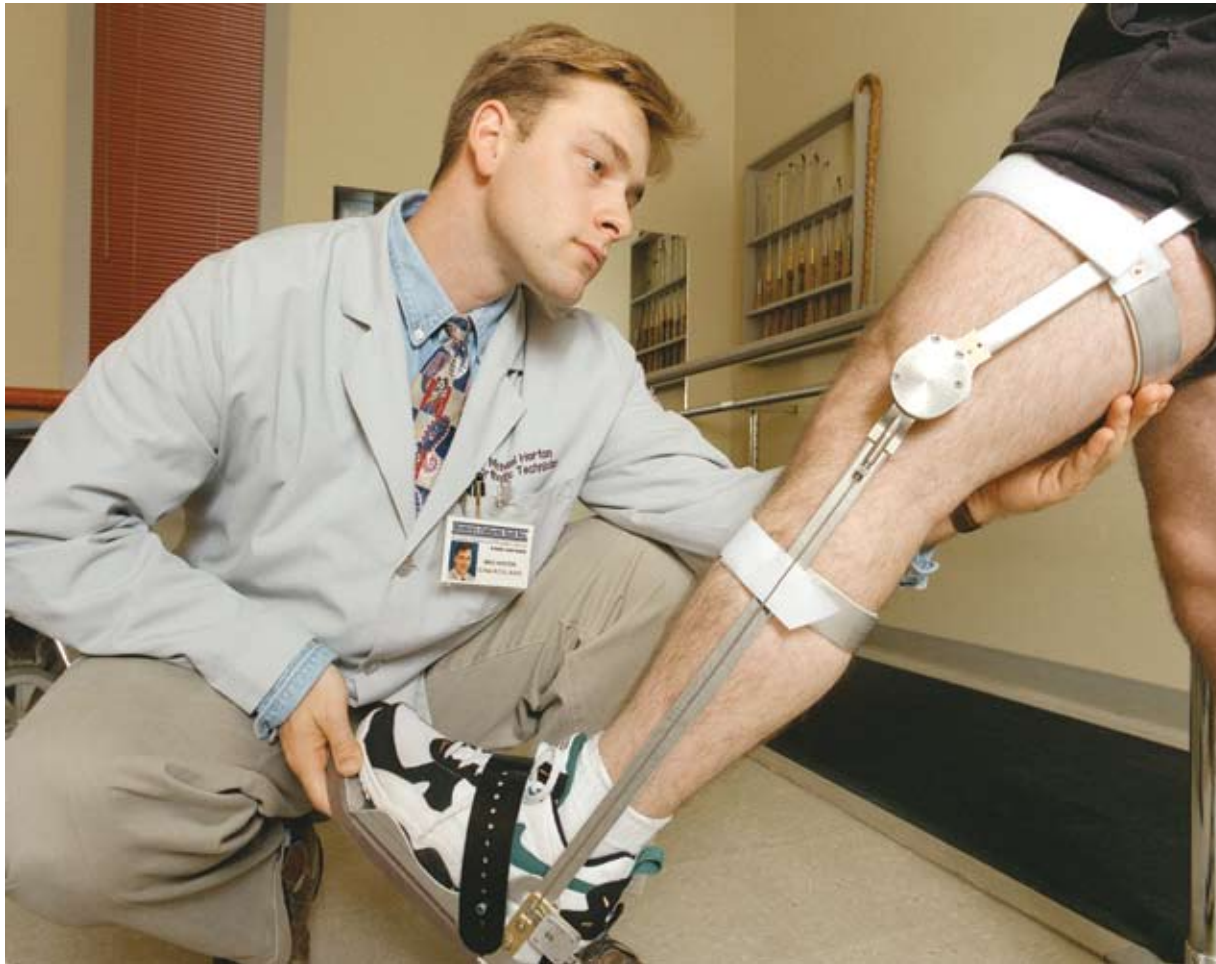
The selectively lockable knee brace facilitates faster, less painful rehabilitation by allowing movement of the knee.

it is ideal for people with weak quadriceps muscles due to polio, spinal cord injuries, and other conditions; such as unilateral leg paralysis. The lightweight orthosis allows patients to regain their mobility and assist them in more energy-efficient ambulation.