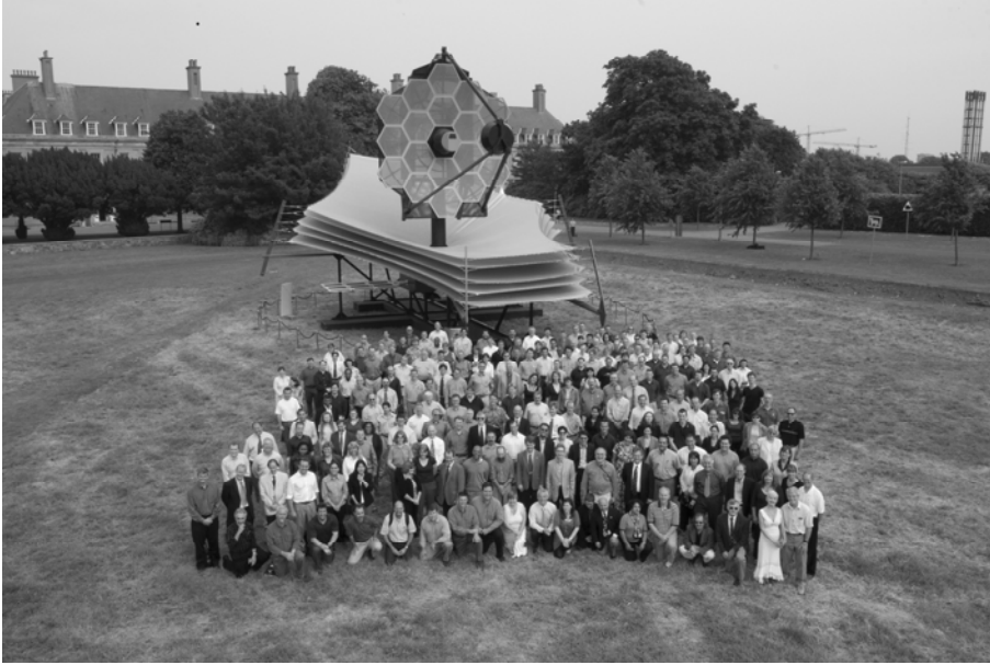
Figure 31-1 Model of JWST (NASA)