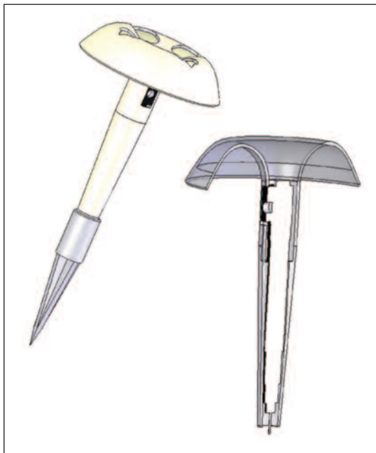
Figure 2. CAD Models of the penetrator prototype.

A lightweight, low-power camera dart has been designed and tested for context imaging of sampling sites and ground surveys from an aerobot or an orbiting spacecraft in a microgravity environment. The camera penetrators also can be used to image any line-of-sight surface, such as cliff walls, that is difficult to access.