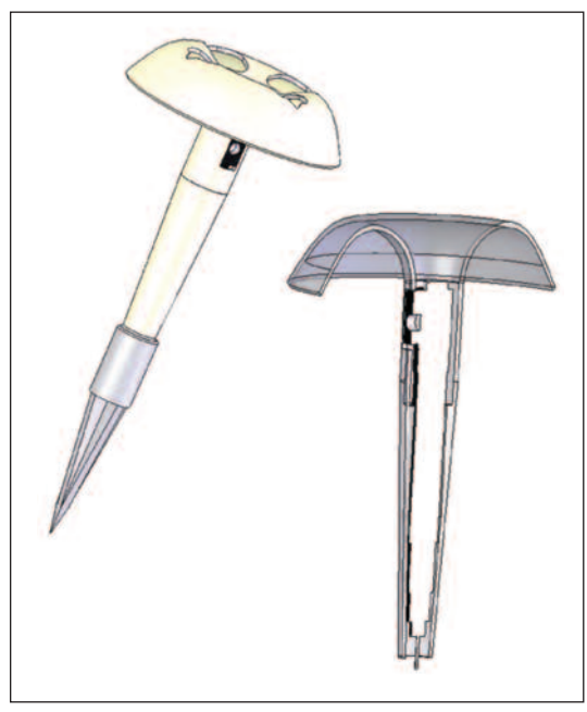
Figure 2. CAD Models of the penetrator prototype.

A lightweight, low-power camera dart has been designed and tested for context imaging of sampling sites and ground surveys from an aerobot or an orbiting spacecraft in a microgravity environment. The camera penetrators also can be used to image any line-of-sight surface, such as cliff walls, that is difficult to access.