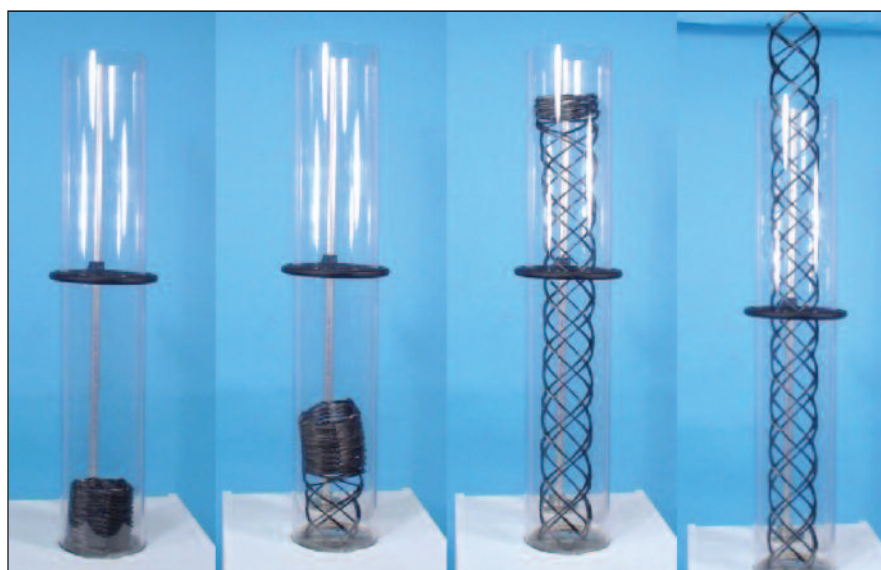
Activation Sequence of an early prototype self-deploying truss shows one one-minute duration from compressed [2.5 in. (6.4 cm)] to deployed [28.5 in. (72.4 cm)].

When cooled below T_g , the SMP reverts to a rigid state and holds the truss in the stowed configuration without external constraint. Heating the materials above T_g activates truss deployment as the composite material releases strain energy, driving the truss to its original “memorized” configuration without the