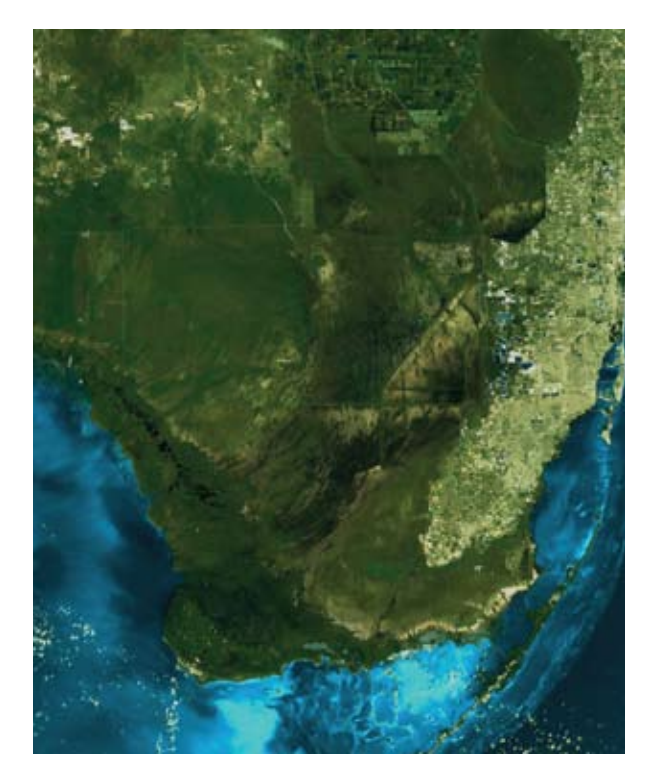
Launched in 1999, Landsat 7 continues to provide stunning, detailed images of Earth, like this shot of South Florida. Images like these provide unparalleled views of the impact of natural and manmade factors on the health of the planet.

CASA is a highly automated feature detection/extraction system. The system contains global libraries of expected spatial, visual, and near-infrared spectral and