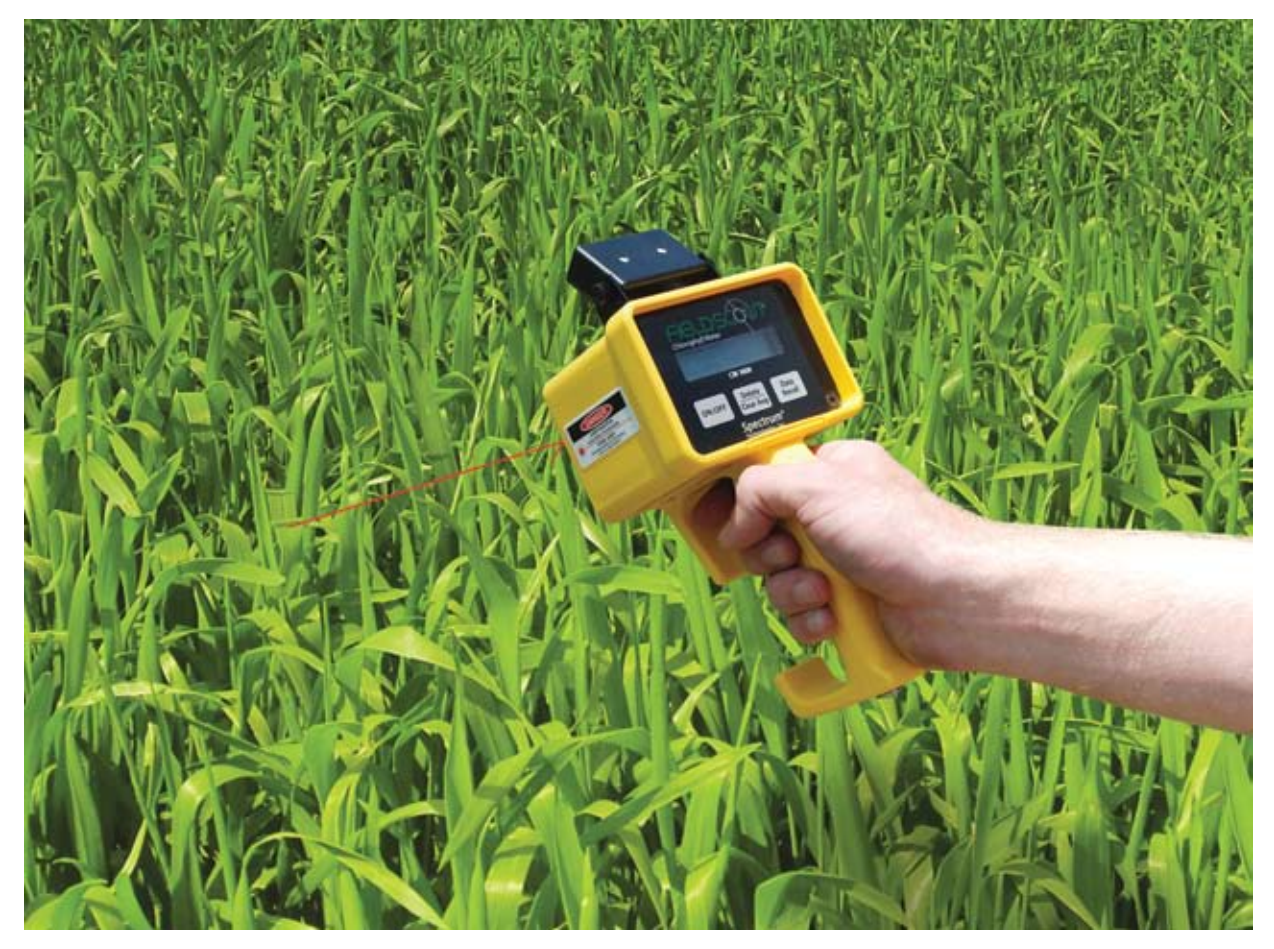
The NASA-derived, point-and-shoot FieldScout meter can take chlorophyll measurements from individual leaves or across a canopy, providing valuable information for nutrient management of crops and turf grass.

levels in the ground. Growers can respond by providing health-boosting doses of nitrogen fertilizer.