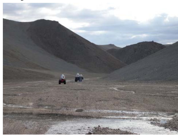
Fig. 19: An example of the treacherous driving conditions on Devon Island. Brian Shiro, Vernon Kramer, and Joe Palaia are shown riding the ATVs.

The first observation concerns the psychological makeup of the 2009 FMARS crew with regards to personal safety and risk. As is the case with most explorers and adventurers, 18 the members of the 2009 FMARS crew tended to be individuals who were very comfortable with a certain degree of risk. The potential for danger was quite evident on Devon Island; quicksand type mud, polar bear encounters, extreme weather conditions, riding all terrain Vehicles (ATVs) on steep rocky terrain, and atypical travel conditions were all possible situations crew members might encounter. These dangers were understood and accepted by all crew members, but this ability to accept risk seemed to translate into a willingness to take some unnecessary risks. There were times when crew members chose to ride ATVs on hazardous terrain (Fig. 19) without helmets, went to get water without a spotter to help watch for polar bears, climbed the satellite tower without a harness, or rode on the back of an ATV, which was expressly prohibited by a safety