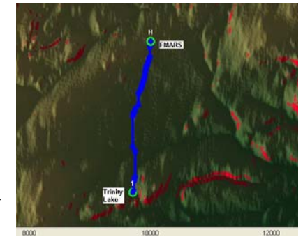
Fig. 20: A screenshot of an EVA traverse using Mission Planner

I also discovered that surface exploration EVAs are very different from EVAs performed in microgravity. ISS EVAs are performed by running through step-by-step procedures practiced extensively on Earth with well known conditions. Surface exploration EVAs will require crews to modify their plans regularly based on surface conditions, weather, and field observations. Crews will no longer be able to rely on the ground team for real-time troubleshooting assistance or consumables monitoring (oxygen usage, battery time, etc.). At FMARS, I tested a new software tool that may be used in the future for surface EVAs called Mission Planner. This tool is being developed by the Man Vehicle Lab at the Massachusetts Institute of Technology. The Mission Planner software can be used to pre-plan an EVA traverse to find the most efficient, and safest, route between the habitat and a desired site for exploration. This is just one example of the types of new tools that will need to be developed for surface EVAs. I also found that performing meaningful science in an EVA suit can be a challenge. The simplest tasks become complicated: picking