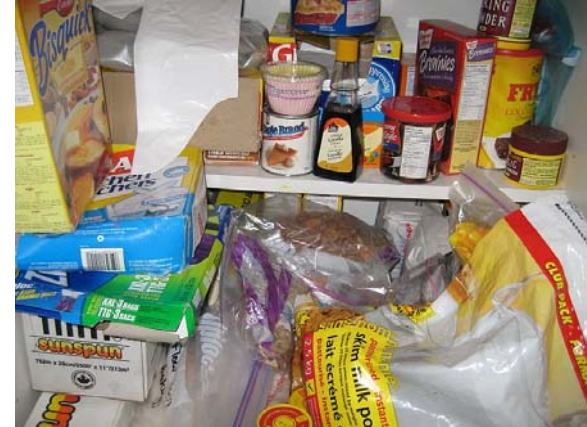
Fig. 9: FMARS Baking cabinet. Highlights include Bisquick, powdered milk, cake mixes, sugars, various types of flour, vanilla and yeast.

Dinners were usually some combination of canned meats, canned beans, or rehydrated textured vegetable protein (TVP) for protein, pasta or rice for carbohydrates, and canned or rehydrated vegetables. The limited choices had the danger of becoming monotonous, so dried spices