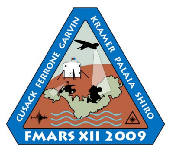
Fig. 7: FMARS XII 2009 crew patch

This generic schedule was very similar to the one chosen for FMARS 2009; Table 1 describes the generic daily schedule chosen, but this often varied significantly based on the day's events.