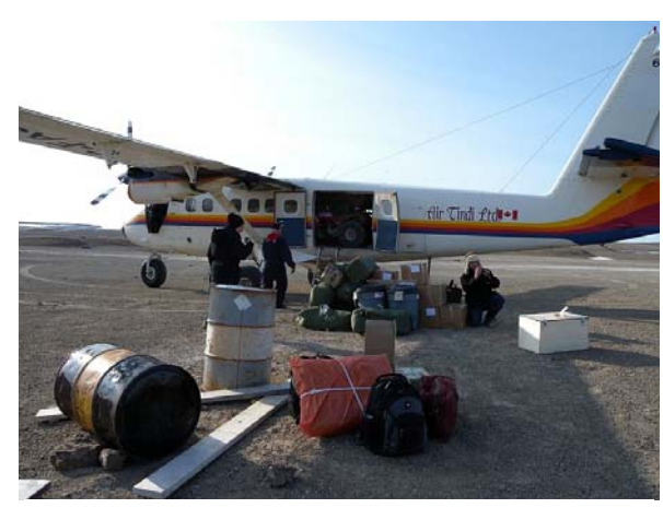
Fig. 4: Loading the twin otter with supplies for FMARS – fuel barrels, personal items, and food.

The second floor of the FMARS Hab is designated for crew living space. A dining/working table sits in the center with folding chairs and desk space is distributed around the curvature of the walls. The kitchen is limited but adequate including a camp stove, miniature refrigerator, toaster oven, microwave, coffee maker, sink, and cabinet space.