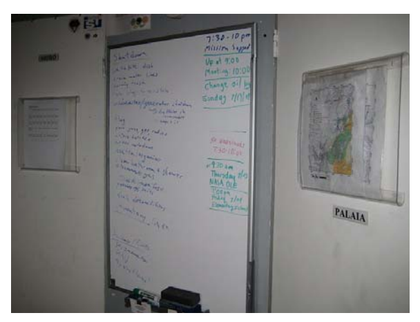
Fig. 6: Crew objectives and tasks whiteboard in the main living area