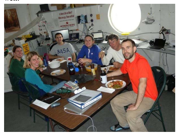
Fig. 8: FMARS XII 2009 crew at the dining table enjoying a meal of pasta and vegetables

Cooking responsibilities were initially distributed evenly with all six crewmembers assigned equal turns in the kitchen, but one crewmember – me - quickly became the unofficial 'chef' because I actually enjoy cooking and was interested in experimenting as much as possible with the ingredients on hand. The act of preparing meals was very therapeutic for me, and I enjoyed preparing tasty meals for my crewmates to enjoy. I learned a lot about my own abilities to be creative in the kitchen - skills (and even a few recipes) which have transferred to my 'Earth' life as well.