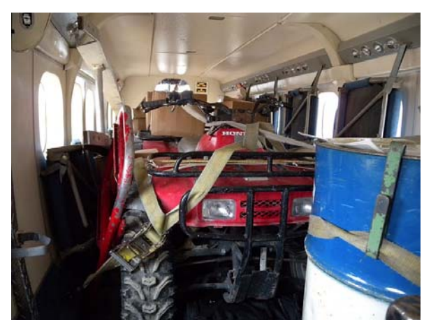
Fig. 5: View from the crew seat on the twin otter flight. Boxes of food are in the background, an ATV is in the middle, and fuel barrel to the right.

Food is selected by the crew and flown before the mission into Resolute Bay from the nearest grocery store in Yellowknife. In order to simulate long-duration spaceflight, food selections are limited to items that have a shelf life of one year or more. The groceries are delivered to the Hab with the crew in cartons and is organized and stowed in the cabinets for the duration of the mission (Fig. 9). Surplus items are stored in the loft above the crew staterooms (Fig. 10). Items such as canned meat, vegetables, and fruits, dried pasta and rice, jarred sauces, and popcorn and potato chips are commonly requested. Resources such as cooking oil or butter and any refrigerated or frozen items are scarce and highly valued treasures to the crewmembers.