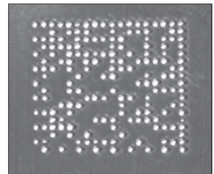
Figure 2. A Data-Matrix Symbol marked with no contrast using a dot peen process on a smooth aluminum target was imaged in the prototype reader at a viewing angle 15° off the perpendicular to the target surface.

(CCD) image detector equipped with a telecentric lens. It also includes a source of collimated visible light and a source of collimated infrared light for illuminating a target. The visible and infrared illumination complement each other: the visible illumination is more useful for aiming the reader toward a target, while the infrared illumination is more useful for reading symbols on highly reflective surfaces. By use of beam splitters, the visible and