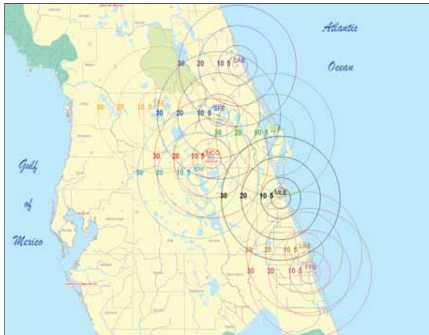
This Map of Central Florida shows the locations of nine sites in the NWS MLB CWA surrounded by 5-, 10-, 20-, and 30-nmi (≈9.3-, 18.5-, 37-, 55.6-km) radius range rings. The Applied Meteorology Unit made changes such that the 5- and 10-nmi (≈9.3- and 18.5-km) radius range rings are consistent with the aviation forecast requirements at NSW MLB.

The AMU also updated the graphical user interface (GUI) with the new data. As in the previous phase, the AMU stratified the climatologies for each location by time interval, distance, and flow regime. New for this phase, the AMU included all data regardless of flow regime as one of the stratifications, added monthly stratifi-