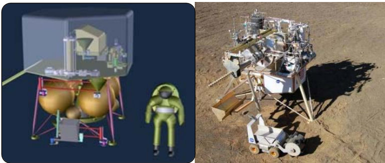
Figure 3. Integrated Pilot Scale ISRU and Surface System Demonstration

Lastly, should sufficient payload mass be available, a larger scale mission that includes full-scale or near-full scale hardware associated with ‘game changing’ technologies for multiple surface systems be considered as a final risk reduction method before human missions begin. By incorporating ISRU, mobility, fuel cell and solar array power, and cryogenic fluid management subsystems into an integrated package and operated on the lunar surface for 6 months to a year, confidence in the ability of the hardware to meet the orders of magnitude increase in life over Apollo hardware could be achieved. Because of the expense of performing long-term environmental chamber tests on Earth, performing this ‘dress rehearsal’ mission may actually be cost effective compared to traditional flight certification testing approaches for spacecraft. Figure 3. depicts both a concept picture of this mission payload as well as a 1 st generation hardware system that was field tested in November 2008 in Hawaii. If the mission is successful, a cache of oxygen, water, or fuel cell reactants could be available for crew use in subsequent missions, freeing up payload mass for other science or exploration hardware.