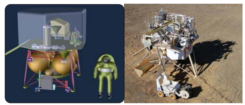
Figure 3. Integrated Pilot Scale ISRU and Surface System Demonstration

Lastly, should sufficient payload mass be available, a larger scale mission that includes full-scale or near-full scale hardware associated with 'game changing' technologies for multiple surface systems be considered as a final risk reduction method before human missions begin. By incorporating ISRU, mobility, fuel cell and solar array power, and cryogenic fluid management subsystems into an integrated package and operated on the lunar surface for 6 months to a year, confidence in the ability of the hardware to meet the orders of magnitude increase in life over Apollo hardware could be achieved. Because of the expense of performing long-term environmental chamber tests on Earth, performing this 'dress rehearsal' mission may actually be cost effective compared to traditional flight certification testing approaches for spacecraft. Figure 3. depicts both a concept picture of this mission payload as well as a 1<sup>st</sup> generation hardware system that was field tested in November 2008 in Hawaii. If the mission is successful, a cache of oxygen, water, or fuel cell reactants could be available for crew use in subsequent missions, freeing up payload mass for other science or exploration hardware.