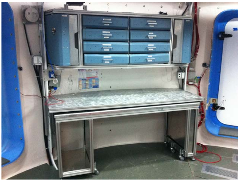
Figure 1. Initial Medical Operations Workstation

cabinets for storing medical supplies. The cabinets consisted of eight drawers total -- two columns of four drawers high with two cabinets, one on each end of the cabinet section.