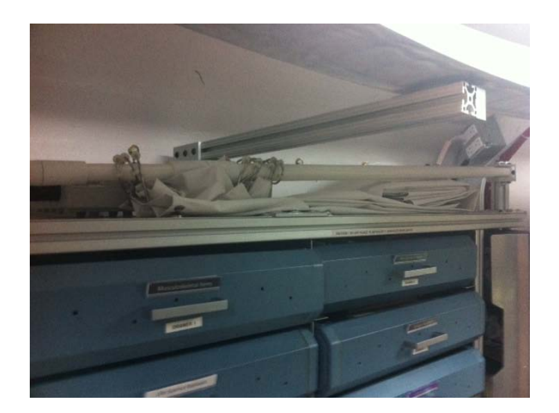
Figure 3. Stowed Privacy Curtain

The large end of the pole was attached to the mount by the cabinets to a 90 degree pivoting nub which allowed the pole to rotate 180 degrees along the horizontal plane. This movement made it possible for the pole to be stored over the cabinets and then deployed out into the HDU to make a privacy barrier along the corridor sides of the MOWS. To cover the area next to the lift, a separate curtain was hung with clamps along the lift rail. This design was implemented to allow the maximum amount of private area during a surgical or medical procedure while not encroaching upon the space of the main corridor and work stations when not in use. This design is also very versatile in configuration, so the deployment can adapt to the needs at the time.