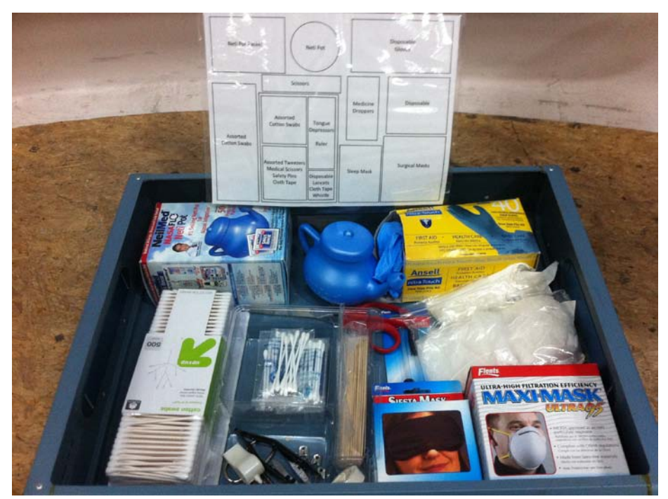
Figure 6. MOWS General Use Items Drawer and Locator Card

Blue labels were used for the drawer with the Medical Diagnostic pack, Therapeutic Items and Medications. Black labels were used for the Musculoskeletal Items drawer. Yellow labels corresponded to the Skin Preparation, Wound Repair Items, and Bandages drawer. The General Use Items were located with a pink-labeled drawer. Miscellaneous Items were labeled with green, and the Life Sciences Kit was labeled with purple.