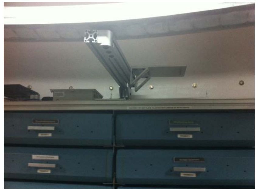
Figure 8. Stowed Camera Arm Mount

The arm consists of two sections, one 28 inch piece of 1.5 inch aluminum extrusion, and a second 22 inch length of 1.5 inch aluminum extrusion. The two pieces were connected with a pivoting nub that allowed 180 degree rotation of one of the beams. The longer arm was attached to a short mounting piece by the back of the HDU wall, 4 inches above the cabinets. The camera was mounted to the extreme end of the arm on a flat plate. This design allowed for the camera to be swung out into the main cabin when needed, and stored by the HDU wall when not in operation.