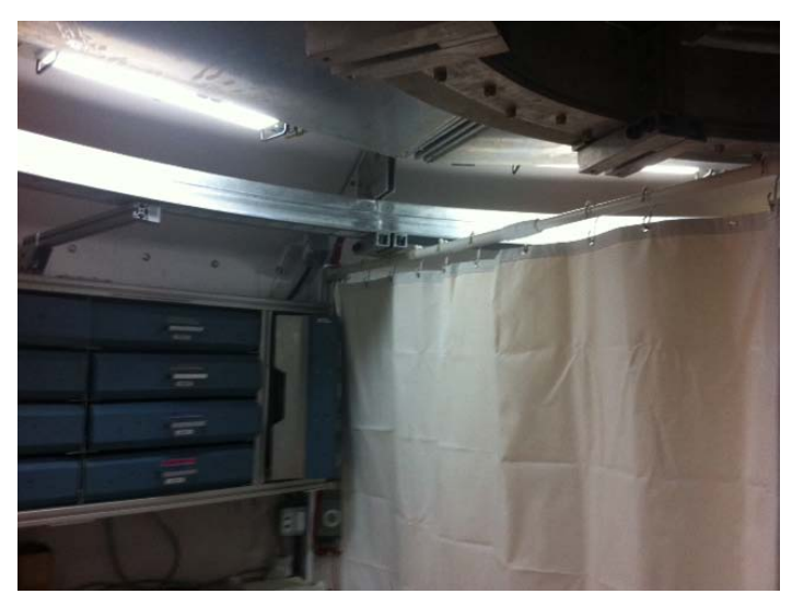
Figure 4. Deployed Curtain, Right Side

The large end of the pole was attached to the mount by the cabinets to a 90 degree pivoting nub which allowed the pole to rotate 180 degrees along the horizontal plane. This movement made it possible for the pole to be stored over the cabinets and then deployed out into the HDU to make a privacy barrier along the corridor sides of the MOWS. To cover the area next to the lift, a separate curtain was hung with clamps along the lift rail. This design was implemented to allow the maximum amount of private area during a surgical or medical procedure while not encroaching upon the space of the main corridor and work stations when not in use. This design is also very versatile in configuration, so the deployment can adapt to the needs at the time.