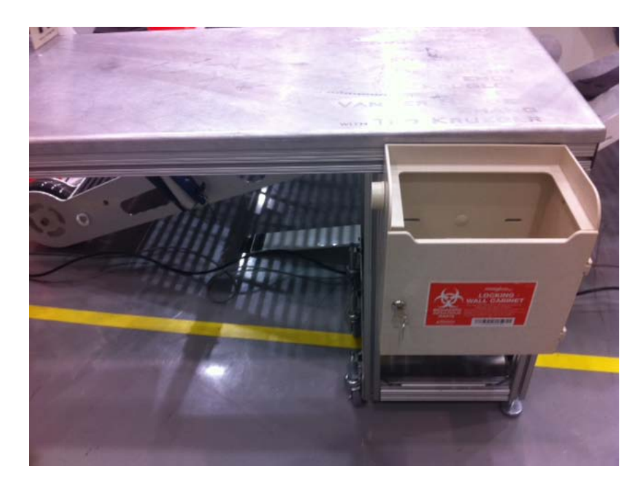
Figure 7. Biological Trashcan Mounted on Surgical Table

The addition of a trashcan for biological waste was required for the MOWS. The container added was a biological waste wall container measuring 12 inches high by 11.5 inches wide by 7 inches deep. This container was large enough to handle all of the biological waste items used in the HDU MOWS. Velcro was added to the back of the container at the top so the biological waste container could be hung in a variety of locations about the MOWS. Locations for hanging the container included the bottom of the cabinets, the bottom of the worktable, and the sides of the surgical table.