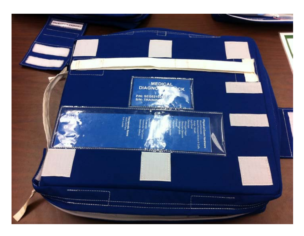
Figure 5. ISS Medical Diagnostic Kit

In order to keep consistent labeling of medical supplies across agency projects, the label system that was implemented followed the model used for the International Space Station (ISS) Medical Kits. Examples from the ISS Medical Kits included blue labels for all medical diagnostic supplies, pink labels for the minor treatment pack, red for the emergency treatment pack, and gray for the IV supply pack. [2]