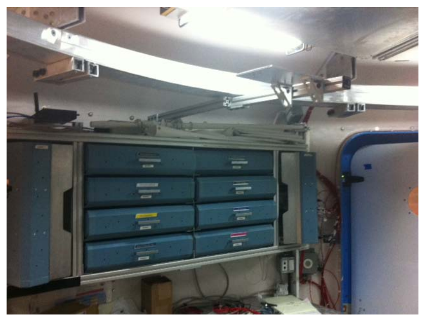
Figure 9. Deployed Camera Arm Mount