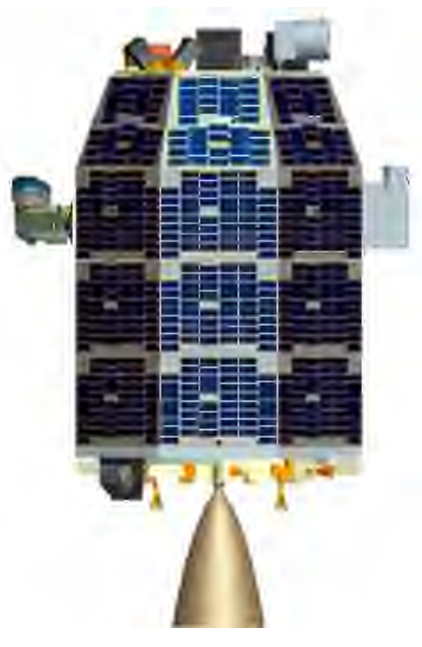
Fig. 2. The LADEE Lunar Orbiter

term to describe the EVeR system's purpose or function. That is the source of the acronym "EVeR", because "One should not EVeR call it a ground system")