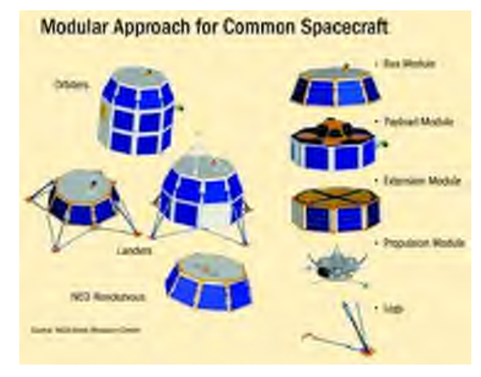
Fig. 1. The Modular Common Bus Concept

The Modular Common Bus Architecture developed by NASA Ames Research Center (Ames) is a design philosophy which develops capability-based spacecraft from readily available off the shelf components in a "Plug and play" manner. By developing modules over time, capabilities can be established enabling new missions to be available to researchers which build off previous design efforts. Examples of the modular concept and vehicles types which are proposed for the future are shown in Figure 1. [4]