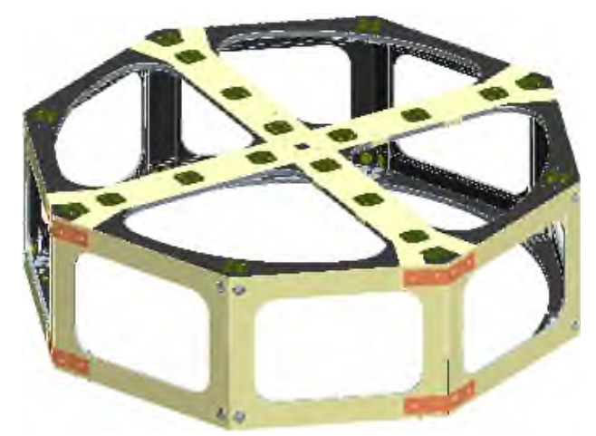
Fig. 3. LADEE Bus Module Showing EVeR System Panel Foiling, Cruciform Foiling, and Bond Straps

The LADEE solution is to provide a thin layer of foil to serve as a low impedance path across the composite panel surface in places where a reference path is needed or where low surface conductivity for charge control is necessary. While it would have been possible to co-cure the foil in the layup of the composite structure, NASA Ames had invested a lot of previous effort into the common modular bus and did not wish to alter composite manufacturing processes and tooling. The EVeR system had to be added to composites post-cure. For this reason, thin layers of aluminum foil are adhesively bonded to the composite after curing using a structurally strong, nonconductive adhesive. Handling needs force the foil to be applied in sections, so bond straps are used to bridge between foiled sections.