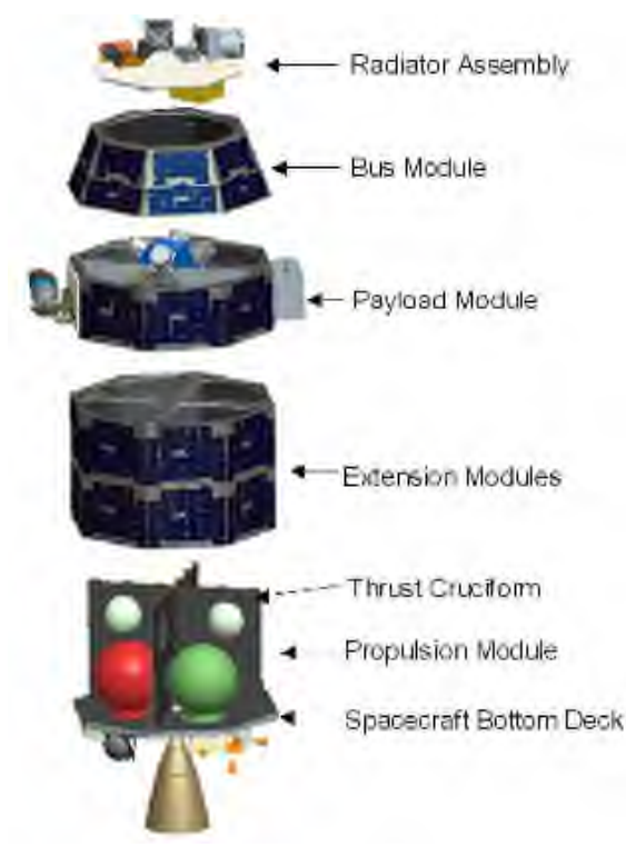
Fig. 3. LADEE Bus Modules

There are four major functions served by the a spacecraft Equipotential Voltage Reference (EVeR) system; to provide a return path for currents in the power system, to provide a voltage reference for avionics, to provide a system to safely collect and distribute accumulated charge, and to serve as a safety system to shunt fault currents away from personnel and equipment. (Note: Some might refer to the EVeR system as the spacecraft's ground system, following a naming convention that dates back to Benjamin Franklin's experiments with lightning and rods driven into Earth's soil, or ground [5]. However with planet Earth a considerable distance away and completely unconnected electrically to the spacecraft by any means; "ground" is a most inappropriate