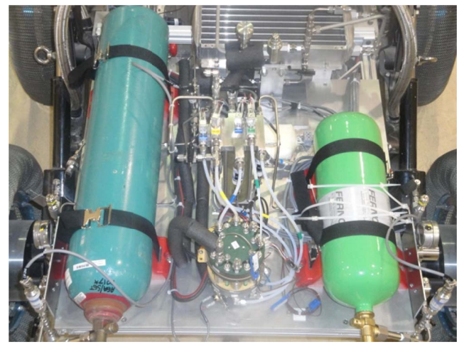
Figure 4.—Overhead view of NFT stack and reactant storage.