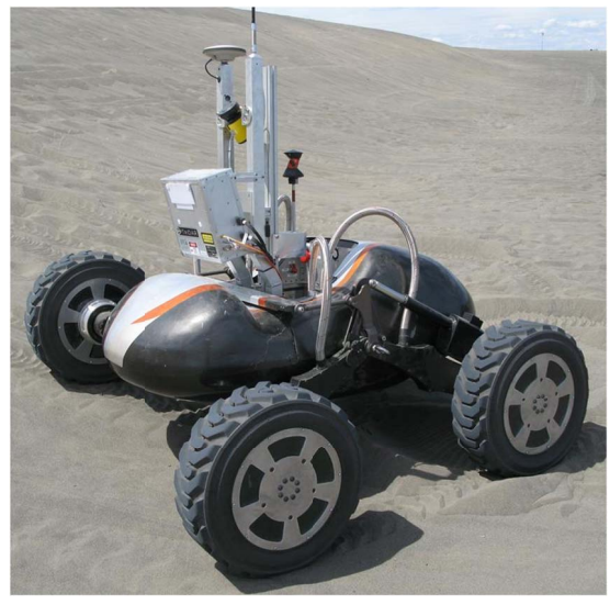
Figure 1.—CMU SCARAB Rover.