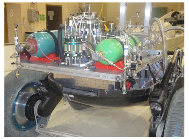
Figure 3.—CMU SCARAB Rover with NFT PEMFC Power System.

The power system successfully demonstrated its goal as a range extender by powering hotel loads on the SCARAB rover, making this demonstration the first to use the nonflow-through fuel cell technology on a mobile platform.